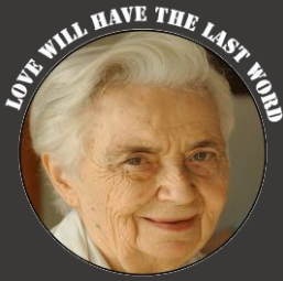
DR. RUTH PFAU FOUNDER MEMBER, MALC 1929-2017