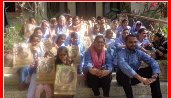
GROUP PICTURE WITH THE GIRLS