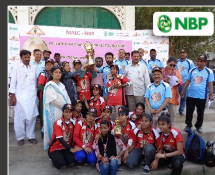
GROUP PICTURE WITH THE WINNING TEAM

On the occasion of International Women's Day (IWD), MALC through the support of National Bank of Pakistan (NBP) organized 'MALC-NBP Dr. Ruth Pfau Memorial Cricket tournament' on March 8, 2018, at KGA Grounds. 8 teams comprising of girls from different schools of Karachi participated enthusiastically in the tournament. It was an honour to have the Minister of Sports & Youth Affairs-Government of Sindh Sardar Muhammad Bux Khan Mahar as the Chief Guest for the occasion. The trivial effort contributed to #PressForProgress; IWD theme, thus encouraging young girls to play more in public places. MALC also expresses its sincere appreciation to KGA for providing their premises free of charge for conducting the tournament. - Resource Mobilization Department