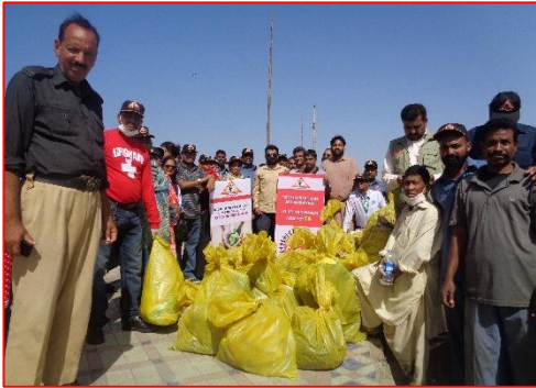
GROUP PICTURE AFTER THE CLEANLINESS DRIVE

On March 24, 2018, MALC commemorated World Tuberculosis Day by organizing an awareness walk and a cleanliness drive at Sea View, Clifton-Karachi. The participation was overwhelming; MALC employees collectively picked up the scattered trash and gathered it in trash bags. Keeping the city clean is everyone’s responsibility, as together we can prevent ailments through a healthier environment.